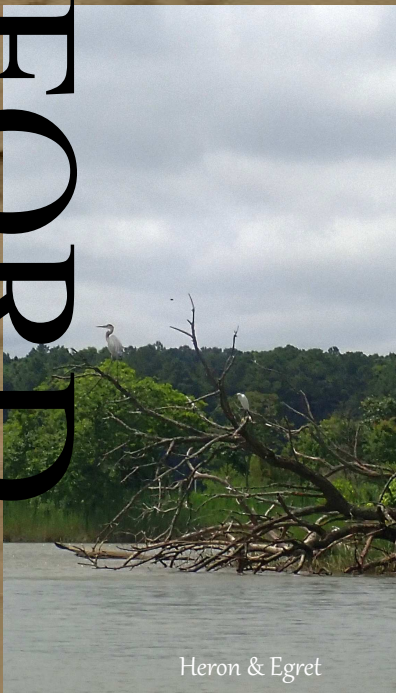
Heron & Egret