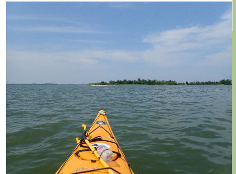
Out to the Choptank