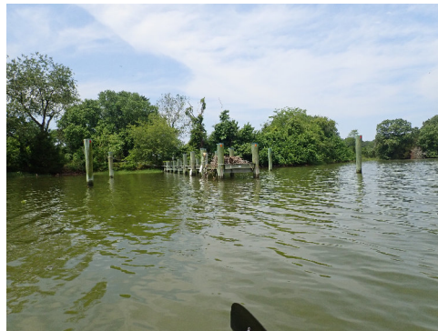
Osprey dock Squatters