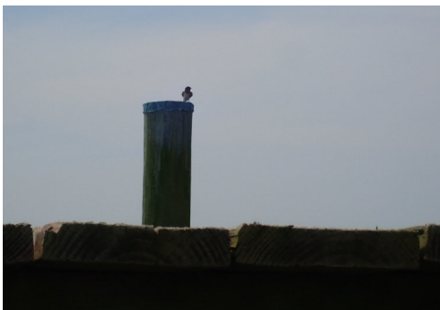
Amazing photo of motionless Tree Swallow