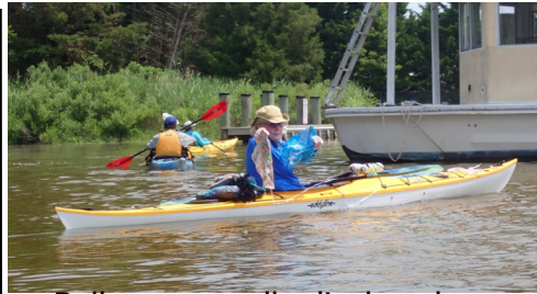
Balloons proudly displayed

W E braved the heat once again and found it cooler on the water as is often the case. Despite our heightened awareness for debris in the water, particularly plastics, we seldom find much but this time two balloons were pulled from the creek thus sparing a creature from an unhealthy snack and certain dyspepsia or worse even. Then there is the houseboat which I failed to properly document by not taking a picture of the words blazoned across the sides and worse I can't exactly recall their ribald nature but they did more than suggest debauchery. Let me know if you can recall in a PM. We paddled about 6 miles and made it to the sand bar just before the creek enters the BIG water of the Choptank. Martin Point Light was in sight. If my faulty memory isn't I think we ate lunch at Victory Garden in Easton.