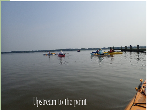
Upstream to the point