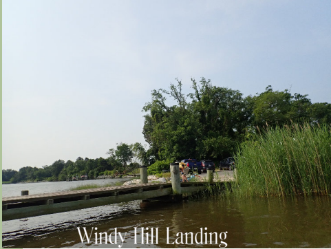
Windy Hill Landing

Abundant dragonflies(Odonata). Threat of thunder storms. Fierce winds slow progress. Strange nest.