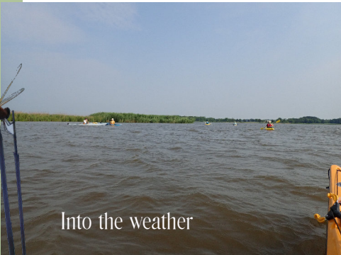
Into the weather

The landing was calm but once out into the Choptank it was slow going against a 15 knot wind. We struggled to make the point upstream with a little wind break against the marsh grasses. We had agreed before hand to limit our paddle as storms were predicted in the early afternoon. As we approached the Bruceville Road bridge, barely 3 miles, the skies to the west suddenly had an ugly greenish hue and an exchange of nervous glances suggested that the bravest were going back. We made it safely back and in fact it didn't storm till later that evening. Never purposely place others in danger. It was a wise choice and the creek is still there for many adventures yet.